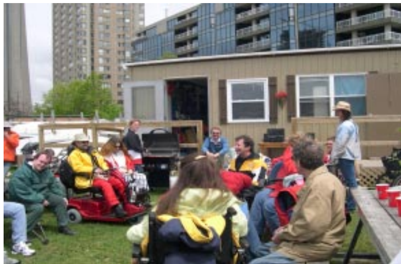
Opening Day - May 23rd, 2005